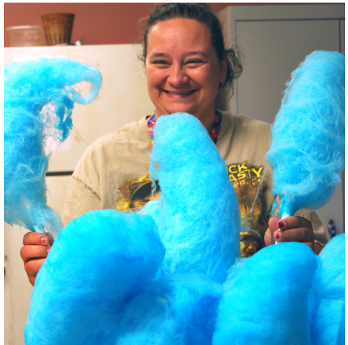
Wraparound Tulsa Family Fun Day