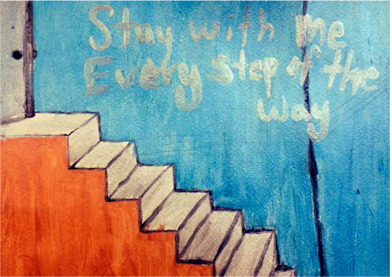
Illustration by CALM Center client